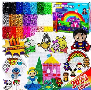
PERLER BEADS KIT