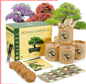
BONSAI TREE KIT